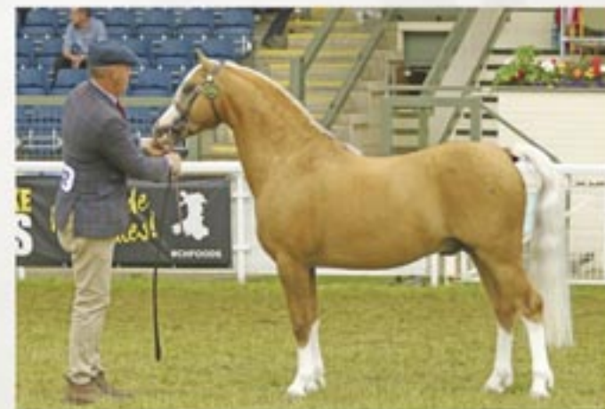
Heniarth Cotton Gold