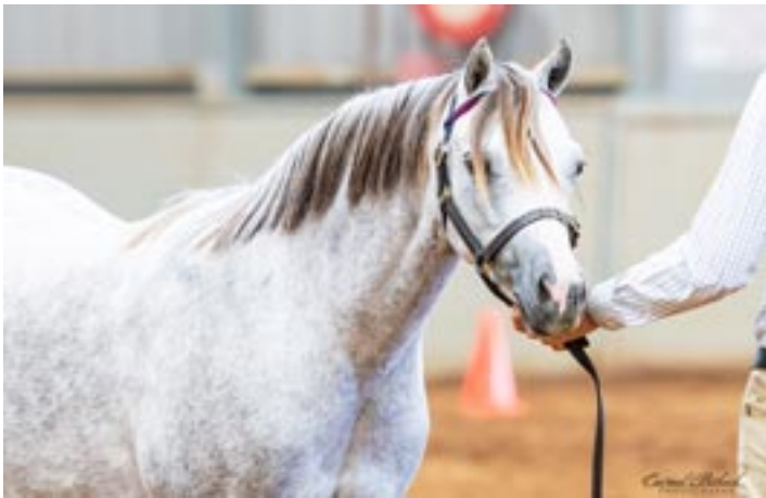
Above: Champion Welsh Pony Youngstock, Trimble & Nobles yearling filly Tooravale Celebration.