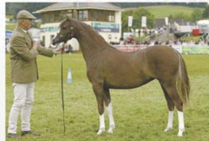
Heniarth In The Mood